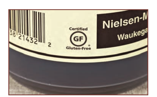
You can find the gluten-free trademark on Nielsen-Massey Vanilla products.

Nearly 40% of shoppers said they have not discontinued their purchase of organic products. Nielsen-Massey makes Organic Madagascar Bourbon Pure Vanilla Extract to serve those who just want to keep it natural.