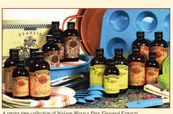
A spring time collection of Nielsen-Massey Pure Flavored Extracts.

your patrons. Try flavoring chocolate with various vanillas from Nielsen-Massey. Try Madagascar Bourbon Pure Vanilla Extract with milk chocolate, Mexican Pure Vanilla Extract with dark chocolate and cinnamon, and Tahitian Pure Vanilla Extract with